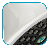
White Item# N2515