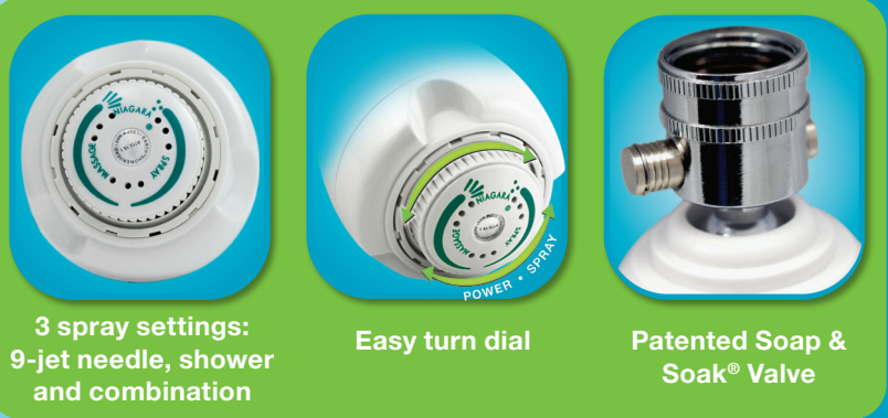
3 spray settings: 9-jet needle, shower and combination