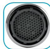
Bubble Spray Item# N3210B-PC