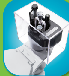
Patented flush chamber & air transfer system